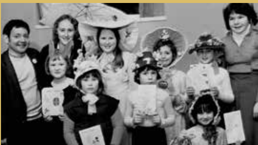
Woodnock Easter Bonnets