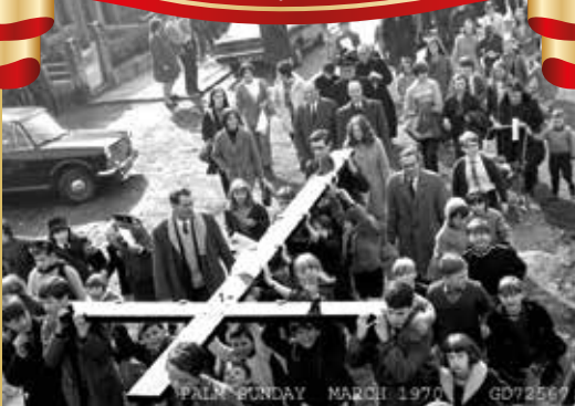
Palm Sunday, March 1970