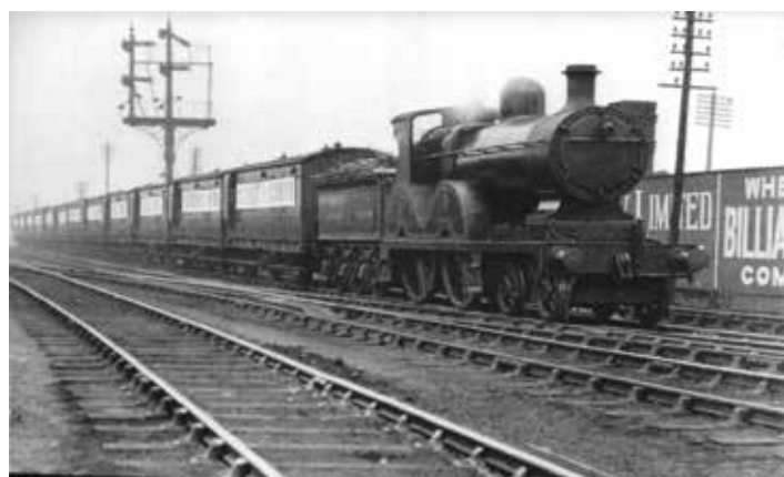
Here they are seen behind one of the L & Y's 4-4-0 tender locomotives, built at Horwich to Aspinall's design in 1894. Normally used on passenger services, this gives some indication of just how valuable this work was to both companies. It is also seen passing a large hoarding advertising the sports equipment made by the Accrington-based firm.